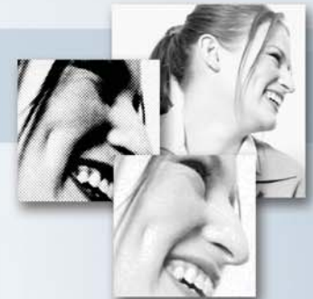
Superior image quality.

Performance doesn't come at the sacrifice of image quality. In fact, the system boasts the finest in its class. It produces crisp, clear images at an industry-leading 2400 x 600 dpi, thanks to a new image processor unit. Clarity is further enhanced by ultra-fine 8-micron toner and 40-micron developer. An 8-bit monochrome scanner renders impressive, high-fidelity grayscales and sharpens onscreen images as well.