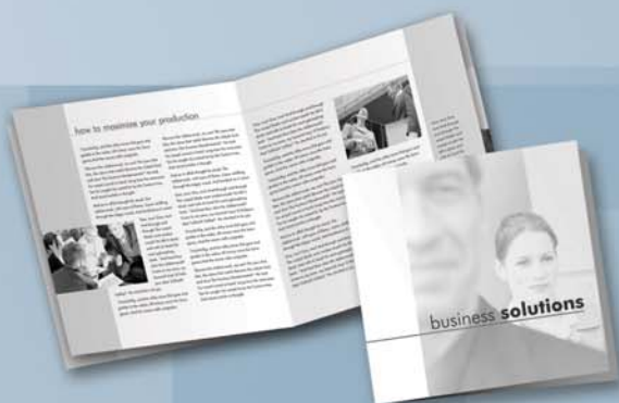
Make professional looking booklets with letter, legal, and ledger-size paper.

More product enhancements are the result of improved paper handling features. A new four-drawer configuration is flexible enough to meet whatever paper requirements you might have. Each drawer can be arranged to accommodate statement to ledger-size paper of up to 110-pound index stock. The system comes standard with a 2,100-sheet capacity, including a 100-sheet Smart Stack Feed Bypass. Add the optional 4,000-sheet LCF for a total of 6,100 and you'll have all the paper capacity you need, whenever you need it.